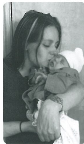
A happy mom and her two-week old

“Going to Associated Pregnancy Services was a great experience because the people there actually care about you. They take the time to listen and give great information and options to give you hope! If you are facing an unplanned pregnancy call them for caring confidential help. Thank you for your services!”